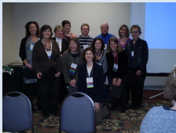
KACE's 2008 Conference Planning Committee